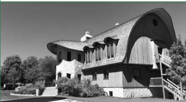
The iconic Beautiful Big Brown Barn.

What do farmers and fisherman have in common? Michael Fields Agricultural Institute (MFAI) in East Troy! On Friday, August 25, MFAI will host dinner in their beautiful Brown Barn featuring fresh gulf seafood, fresh farm produce, local beer and wine and music. The evening event will focus on unlikely partners conserving the environment of the Gulf of Mexico and the Mississippi River. For more information visit www.MichaelFields.org .