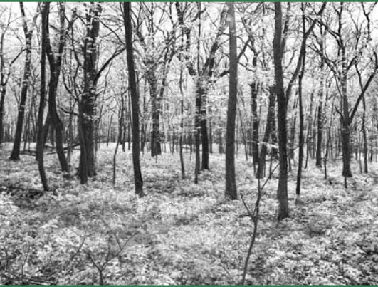
Colman Woods on a November day.

Participants will pick up their tickets at the Conservancy’s Mill House headquarters in Fontana along with a guide and map to each of the properties. The guide will also outline conservation features, including native plants, trees and wetlands to help the participants learn more about the land they are touring. There will be opportunities for short hikes on each of the properties so wear walking shoes and dress for the weather. The owners, landscapers, gardeners and farmers will be on hand at all of the properties to answer your questions.