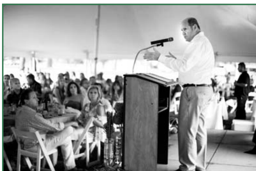
Reid Ribble, former U.S. Representative for Wisconsin's 8th Congressional District, speaks on the importance of working together to save our lakes.