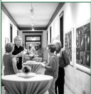
Guests enjoy chatting in the historical hallway of the observatory.