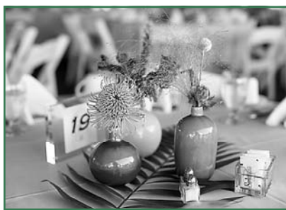
The beautiful centerpieces were donated and arranged by Nancy Powers.