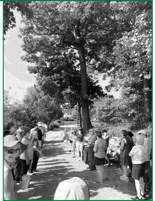
The June 11 Healthy Lakes Open House.